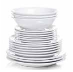
Dishes, mugs & cups