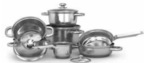
Pot & Pans