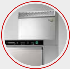
CRC - Heat Recovery System Optional