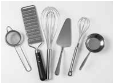
Small kitchen Utensils