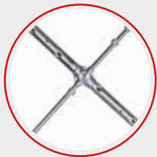
Stainless steel rotating wash and rinse arms. Standard